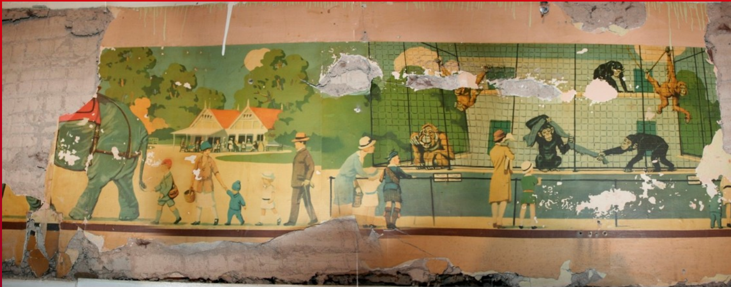
50s Frieze found under the panelling in the Gym.